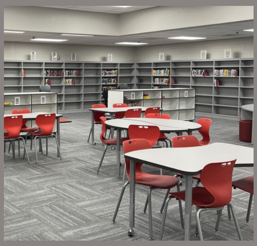
Red Top Middle School Bartow County Schools, GA Media Center Refresh