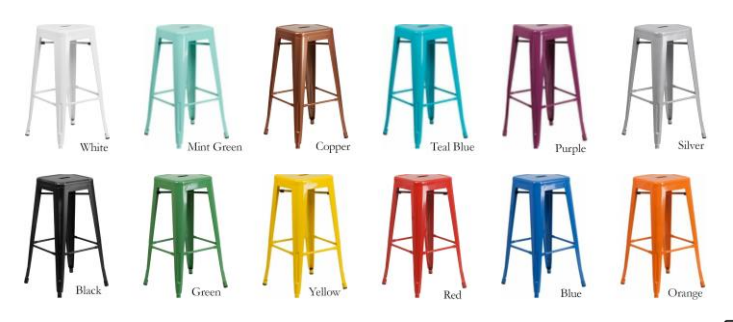
Chair Choices for 26" Chameleon Pods

Stool choices for 34 "or 42" with magnetic mounted stool option