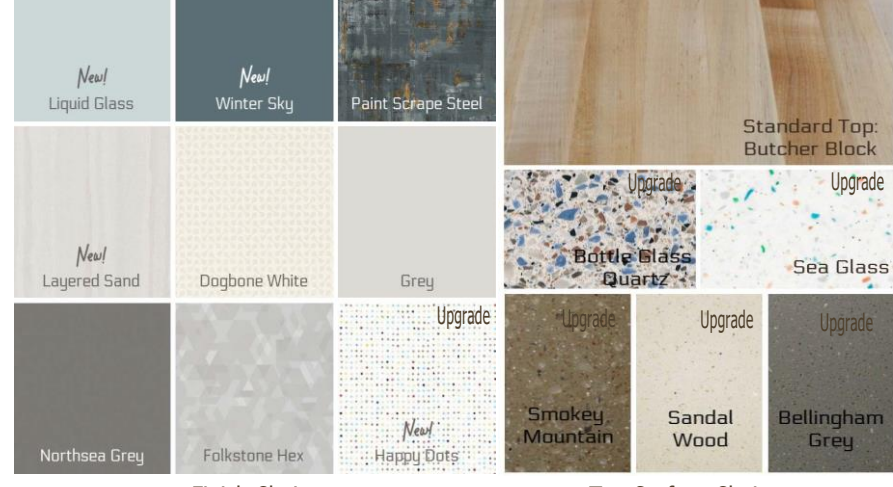
Finish Choices Also Offered With:

Seating Package for Two or Three People for 26" (includes 2 or 3 Spaceforme Chairs-colors of your choice)