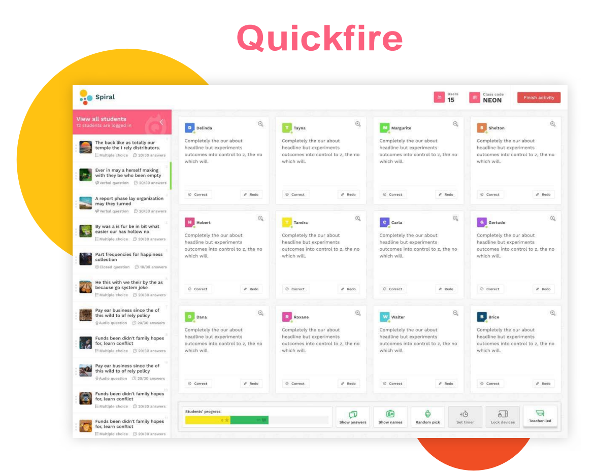
Superquick formative assessment to see what the whole class is thinking